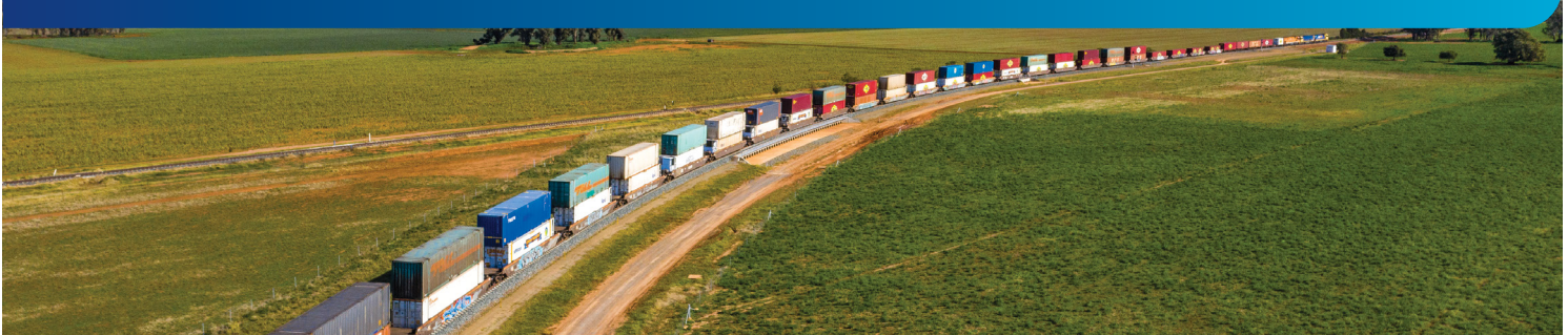
A double stacked train at Parkes.

The Australian and NSW Governments are jointly funding a proposal to grade separate a number of road and rail interfaces in NSW as a result of the Inland Rail project.