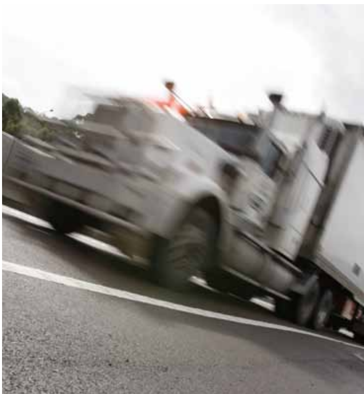
RMS is planning a heavy vehicle bypass

A letter of request for access will be sent to the owners of properties proposed for investigation activities closer to that time.