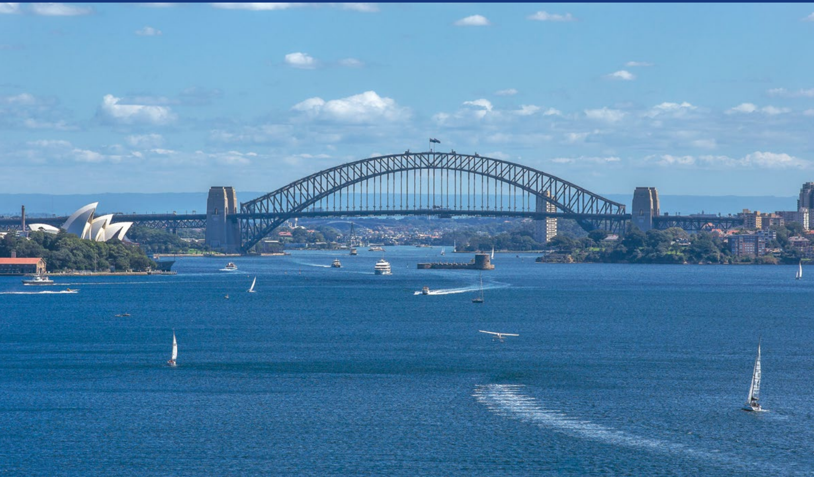
Sydney Harbour in summer.

The NSW Government is investing in projects to modernise and improve access to the Sydney Harbour Bridge. Roads and Maritime Services is installing lifts to the Sydney Harbour Bridge pedestrian walkway to ensure everybody can enjoy the experience of being on one of Australia's most recognisable landmarks.