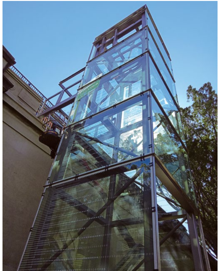
Southern lift shaft