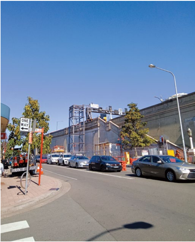
Northern lift viewed from the corner of Broughton Street and Burton Street