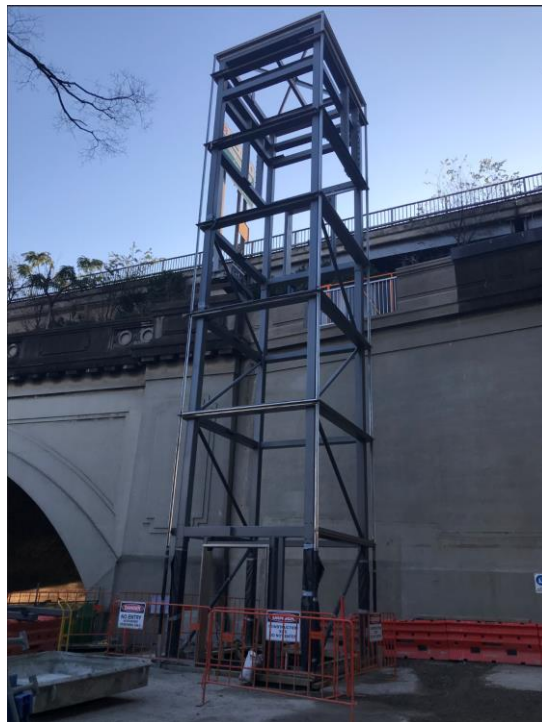
Steel lift structure in place in Cumberland Street