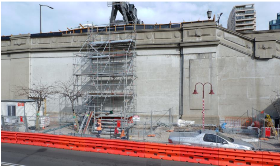
The northern lift construction site on Broughton Street

Our standard construction hours are from 7am to 6pm, Monday to Friday and 8am to 1pm on Saturdays , excluding public holidays.