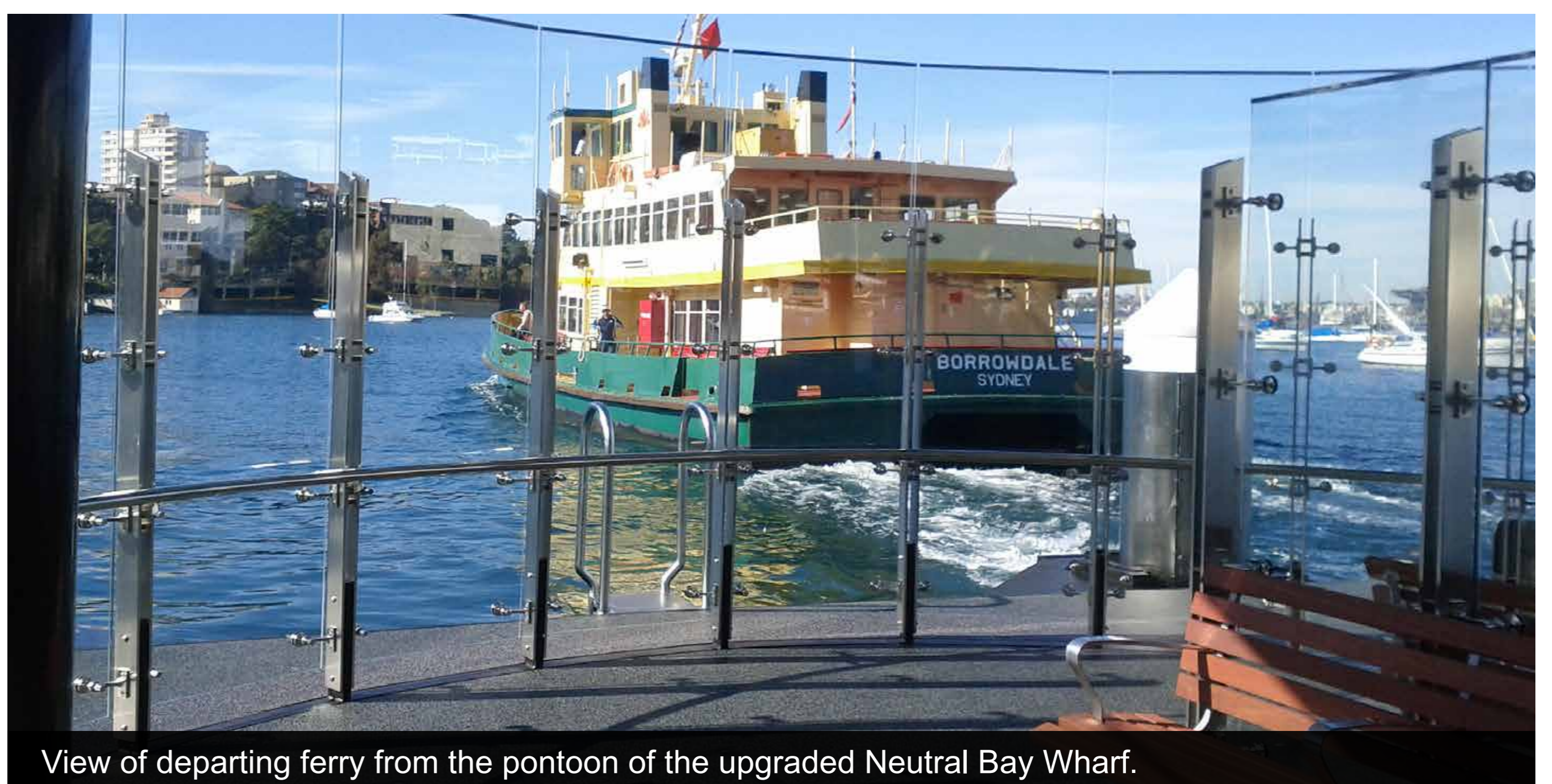
View of departing ferry from the pontoon of the upgraded Neutral Bay Wharf.