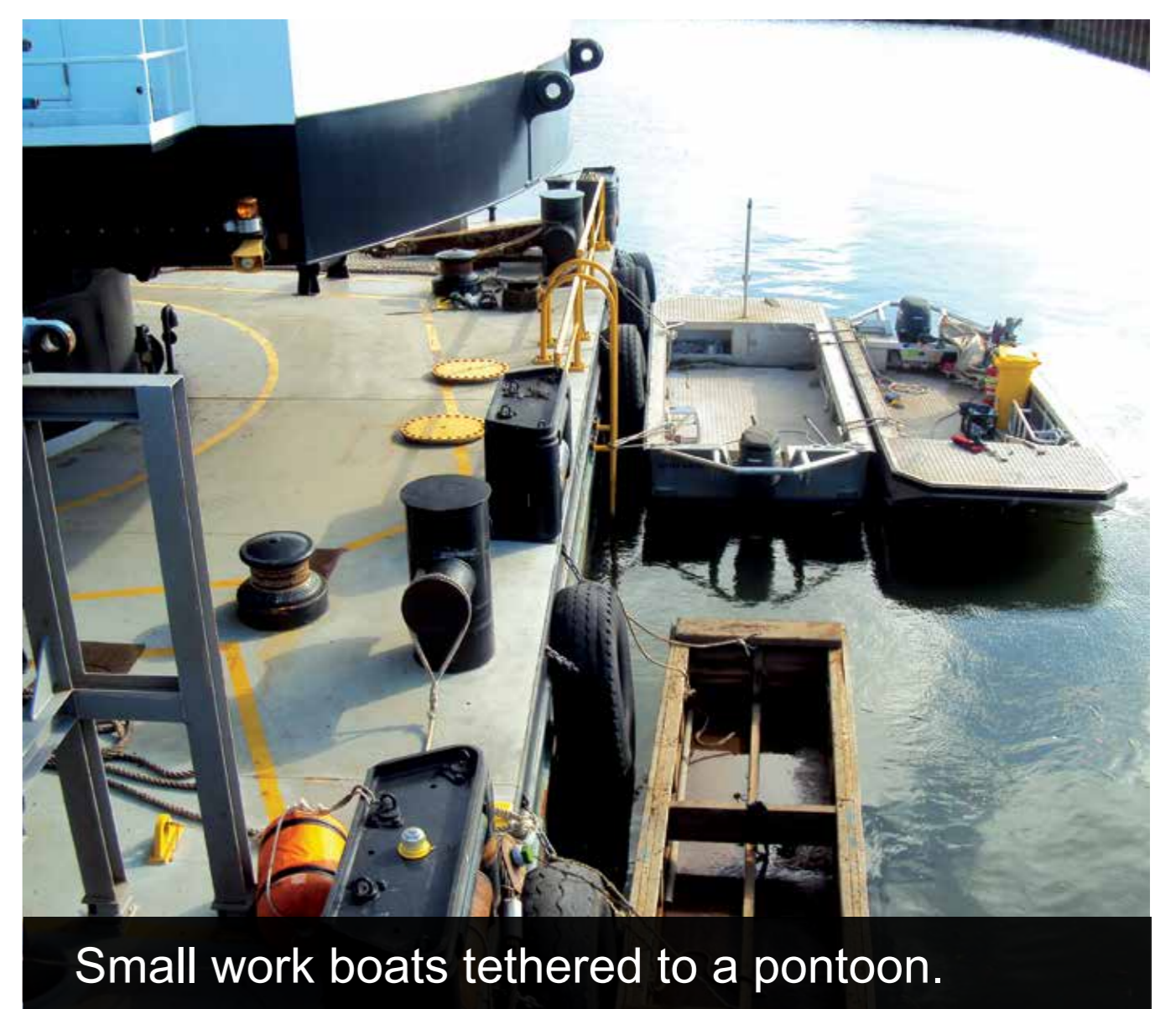
Small work boats tethered to a pontoon.