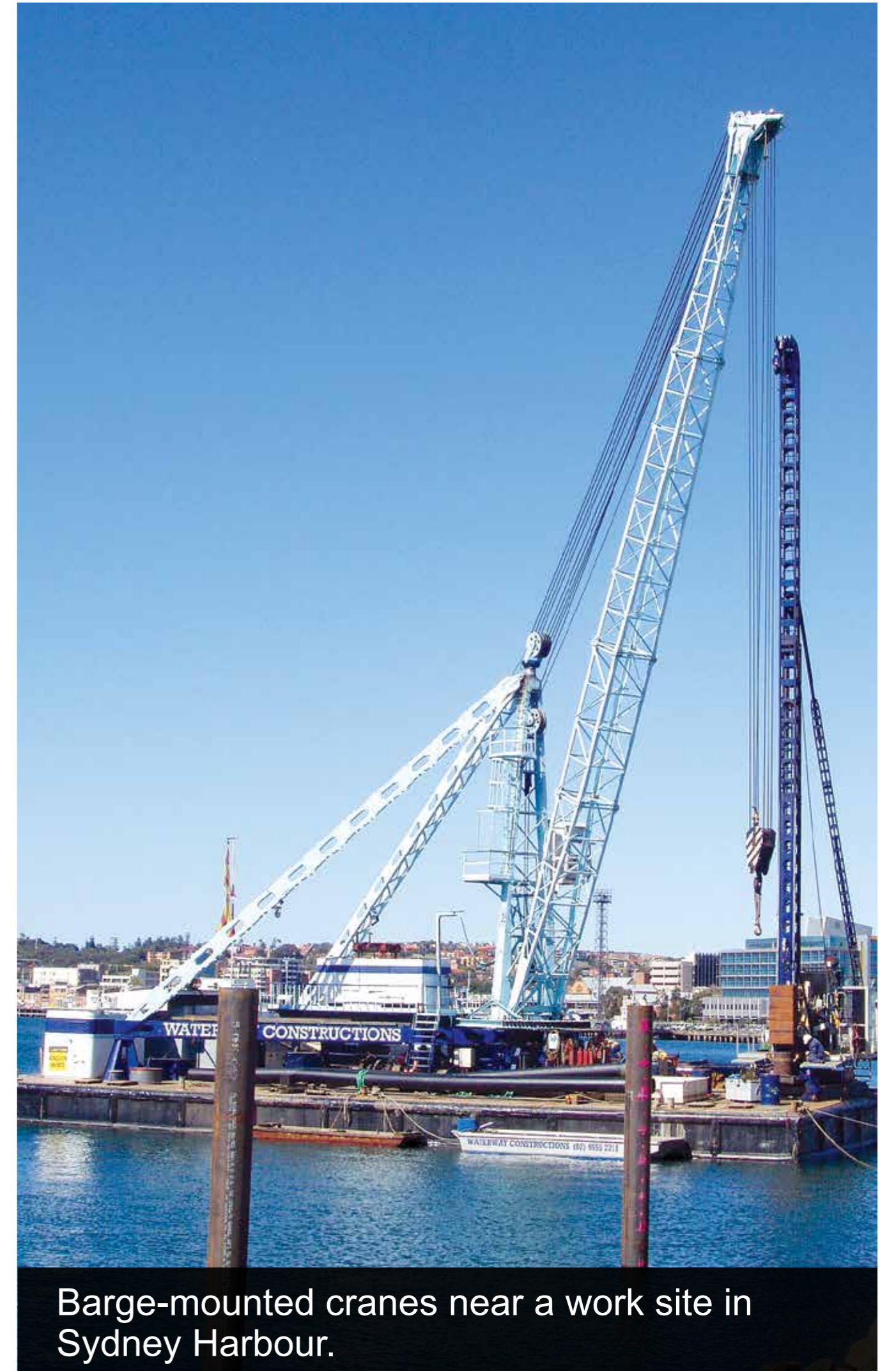
Barge-mounted cranes near a work site in Sydney Harbour.

Water-based construction vessels including a piling barge, barge-mounted cranes and rigs, service barges and small work boats will be used during the upgrade work.