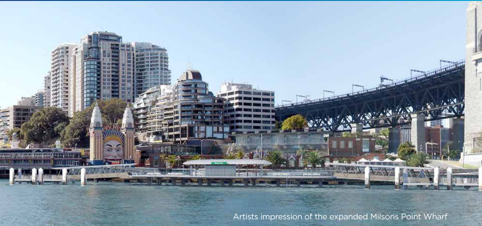
Artists impression of the expanded Milsons Point Wharf