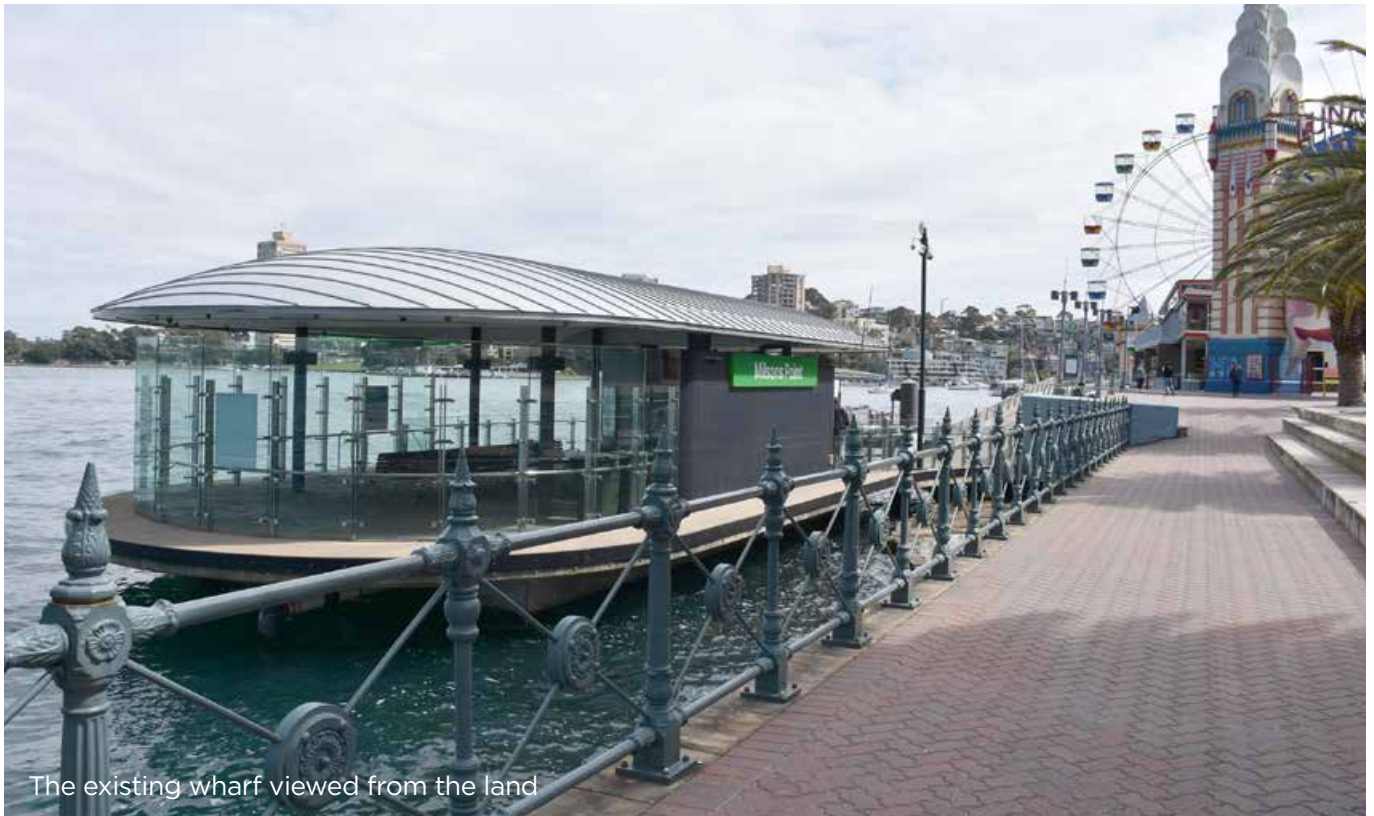
The existing wharf viewed from the land