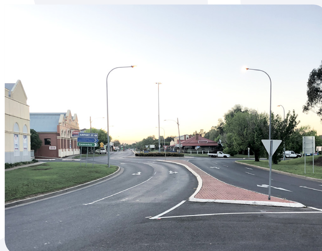
The existing Jewry Street intersection looking towards the Tamworth CBD