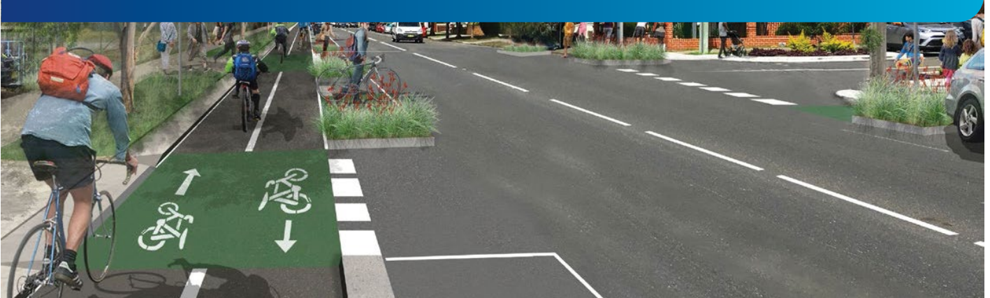
Doncaster Avenue at Carlton Street intersection, Kensington

The Australian and NSW Governments are delivering walking and cycling improvements to provide an active transport link between Kingsford and Centennial Park.