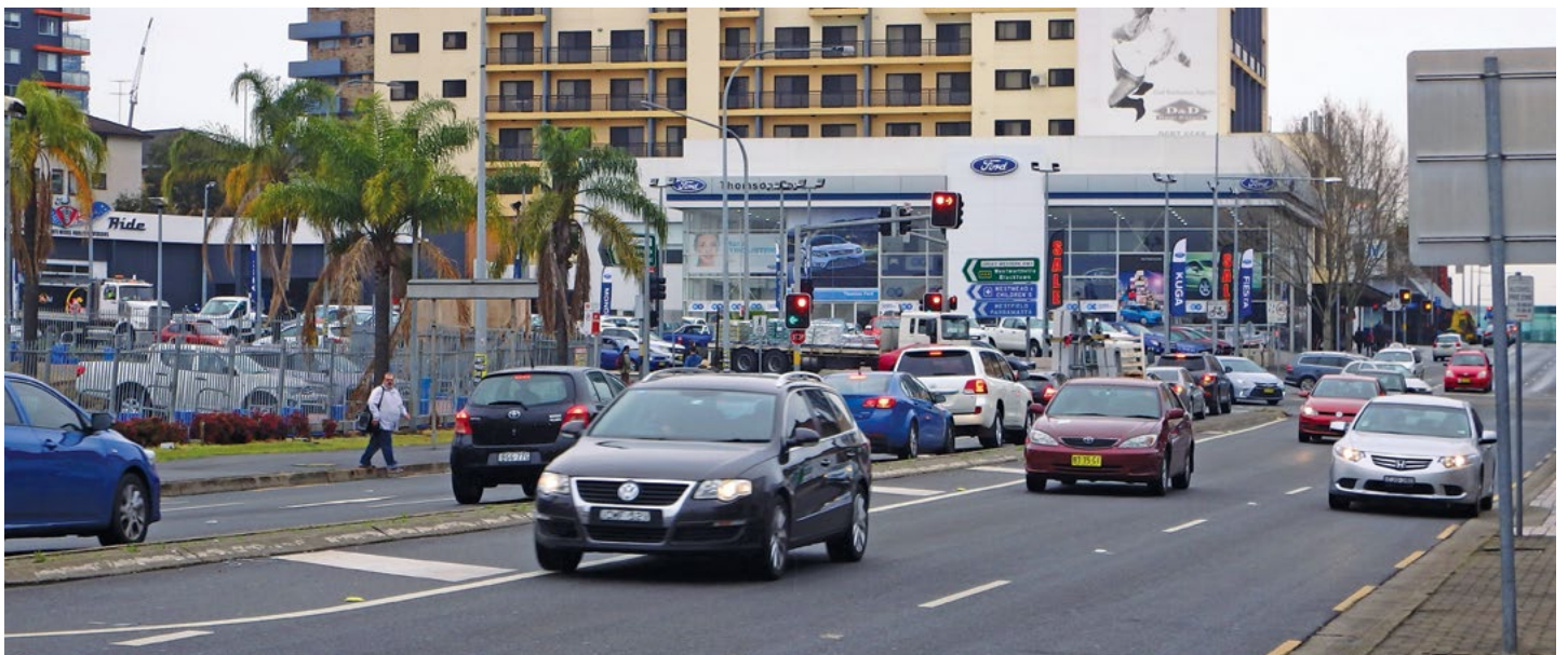
Looking north along Church Street, Parramatta

These roads have been identified as part of a wider proposal to implement amended weekday and new weekend clearways from Parramatta to Ashfield and ultimately into Sydney's CBD.