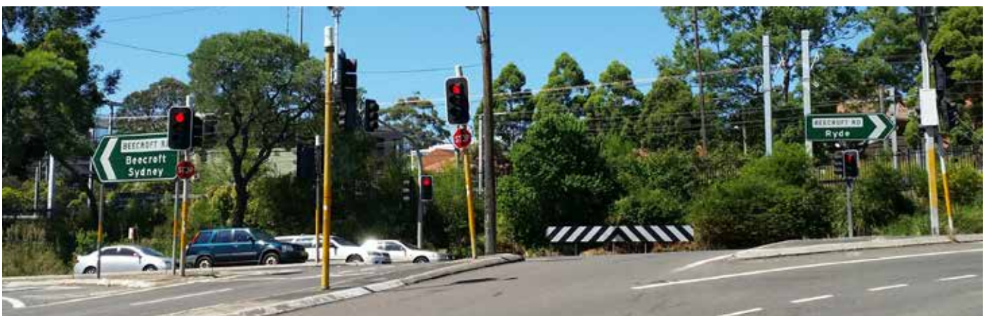
Intersection of Carlingford Road and Beecroft Road, Epping

There will be some noise associated with this work. We will make every effort to minimise its impact by arranging the noisiest work before 11pm .