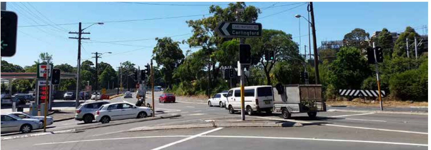
Intersection of Carlingford Road and Beecroft Road, Epping