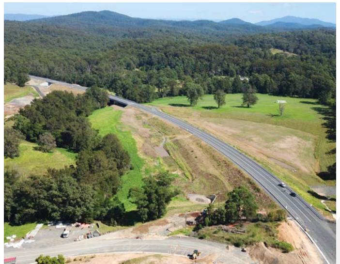
Dignams Creek Princes Highway upgrade during first stage of construction (June 2017) and at end of construction (March 2019)

The Princes Highway upgrade at Dignams Creek is now complete. Motorists can expect a safer journey as they travel along the improved highway.