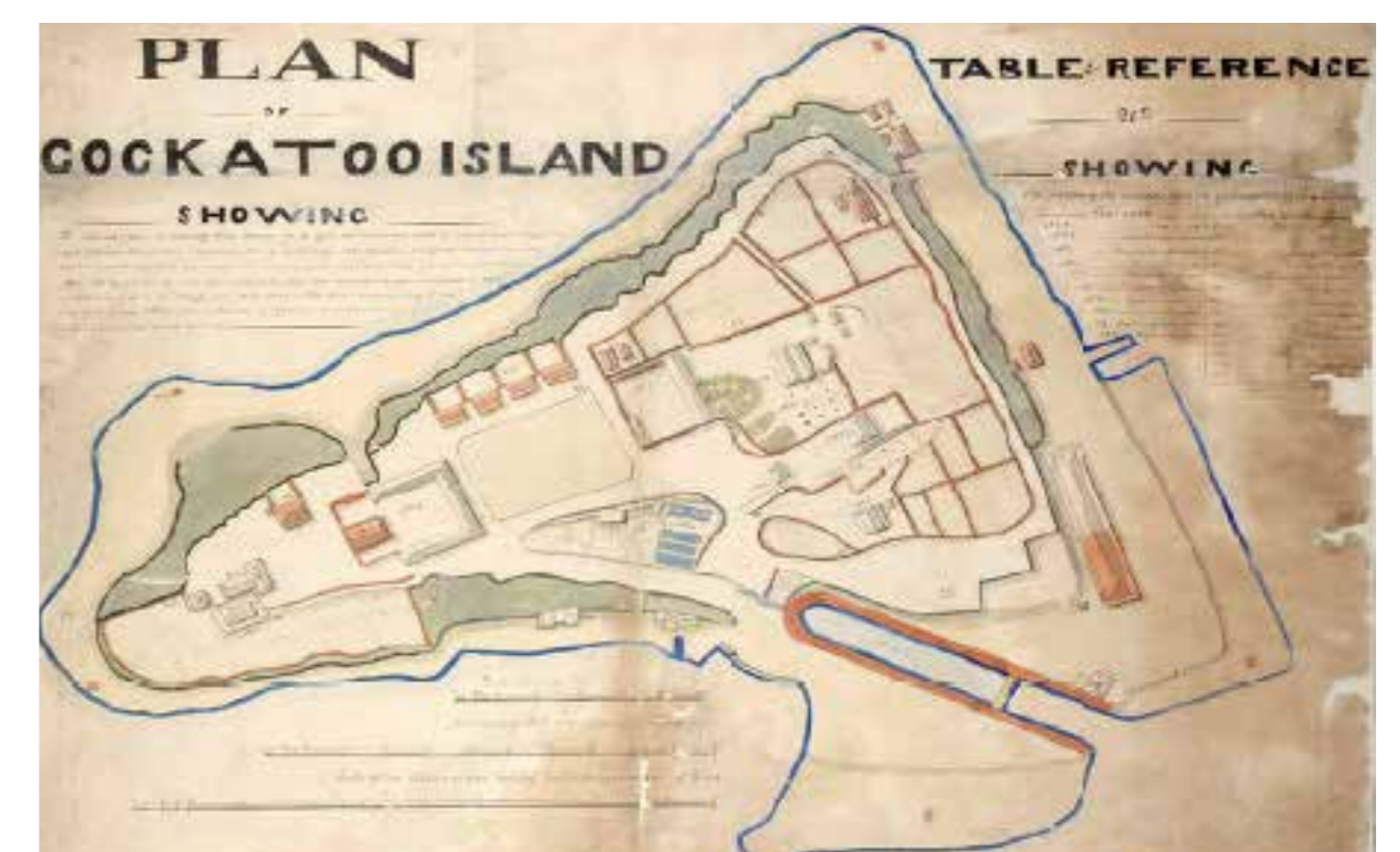
Old plan of Cockatoo Island