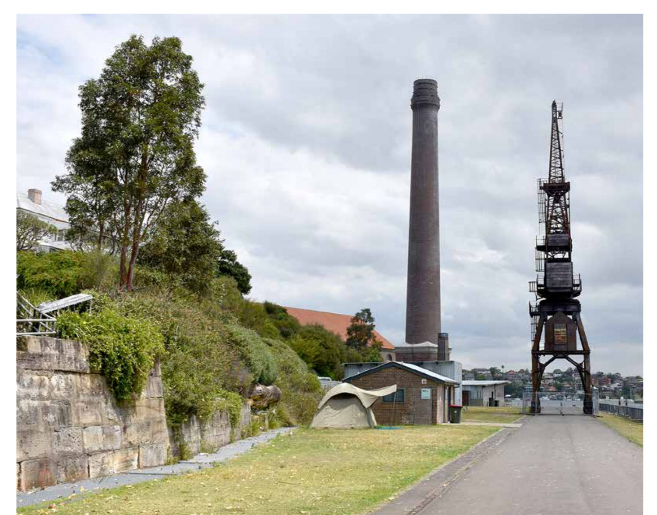
The Powerhouse area