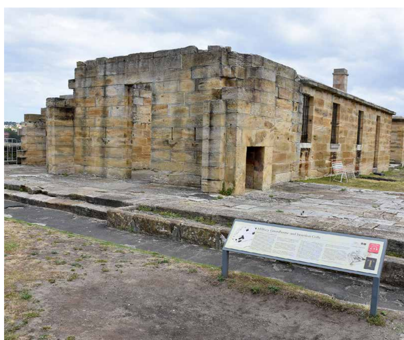
Military guardhouse and isolation cells