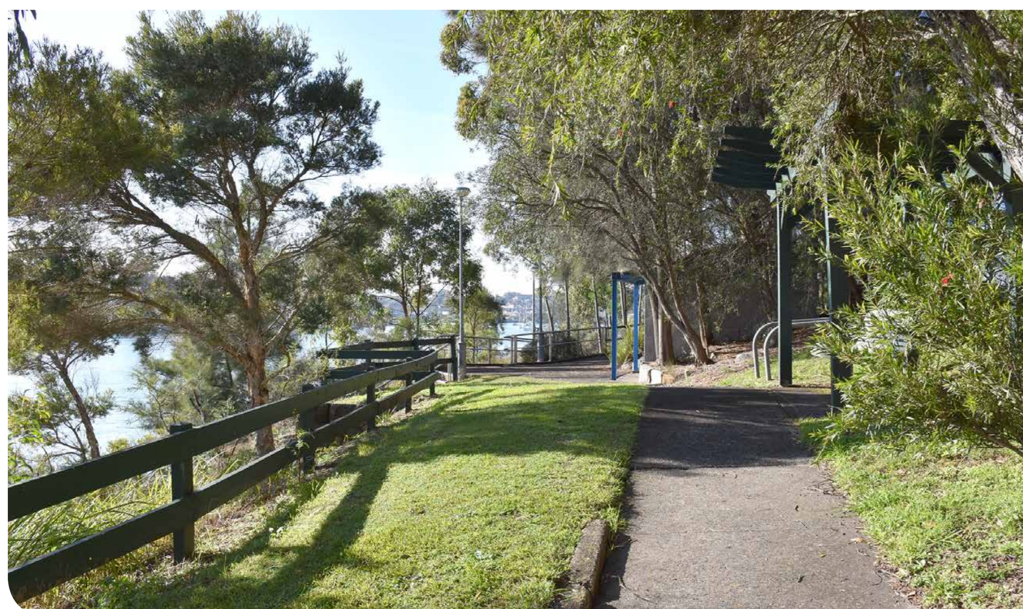
Blackwall Point Reserve

Some out of hours work is necessary to maintain access to all ferry services. Night work will be carried out between 11pm and 7am . Only one night of out of hours work is required during this time.