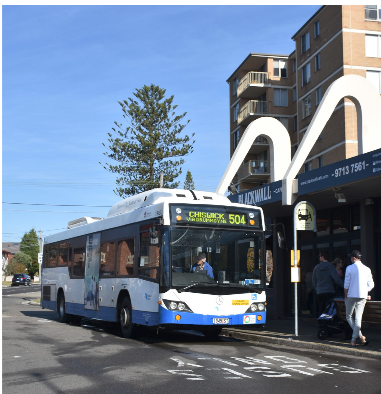
Bus stop near Chiswick Wharf