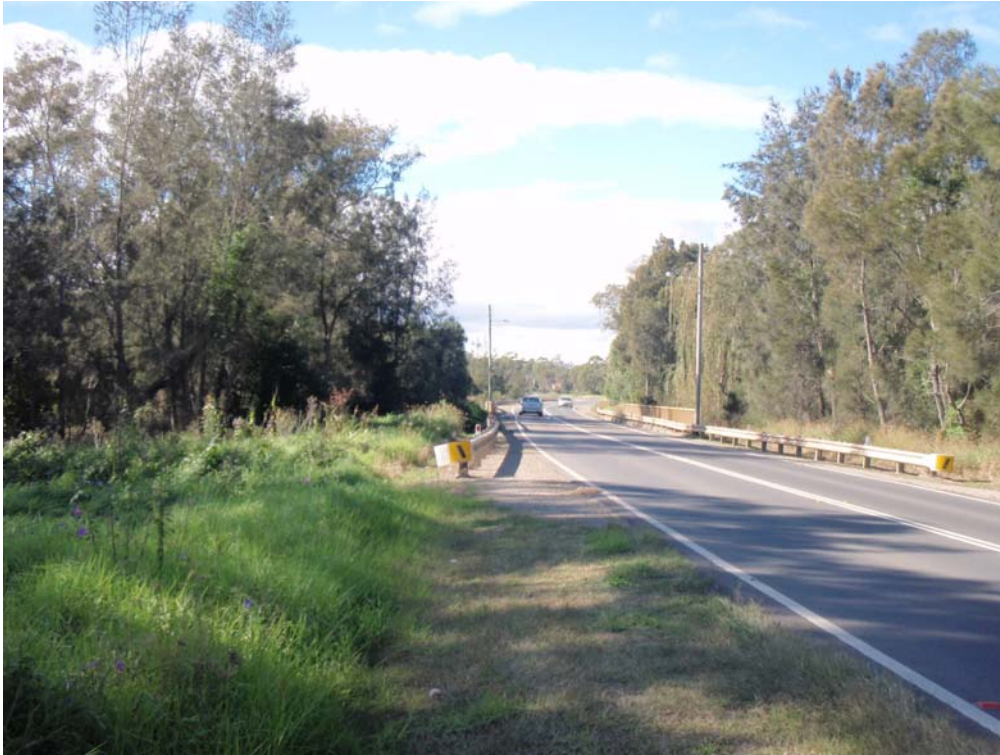
Existing Bringelly Road, Bringelly travelling eastbound