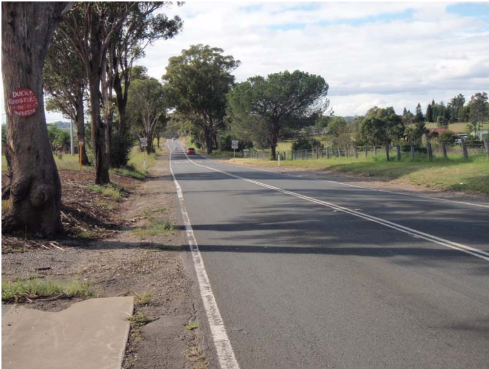
Existing Bringelly Road approaching Kelvin Park Drive travelling eastbound