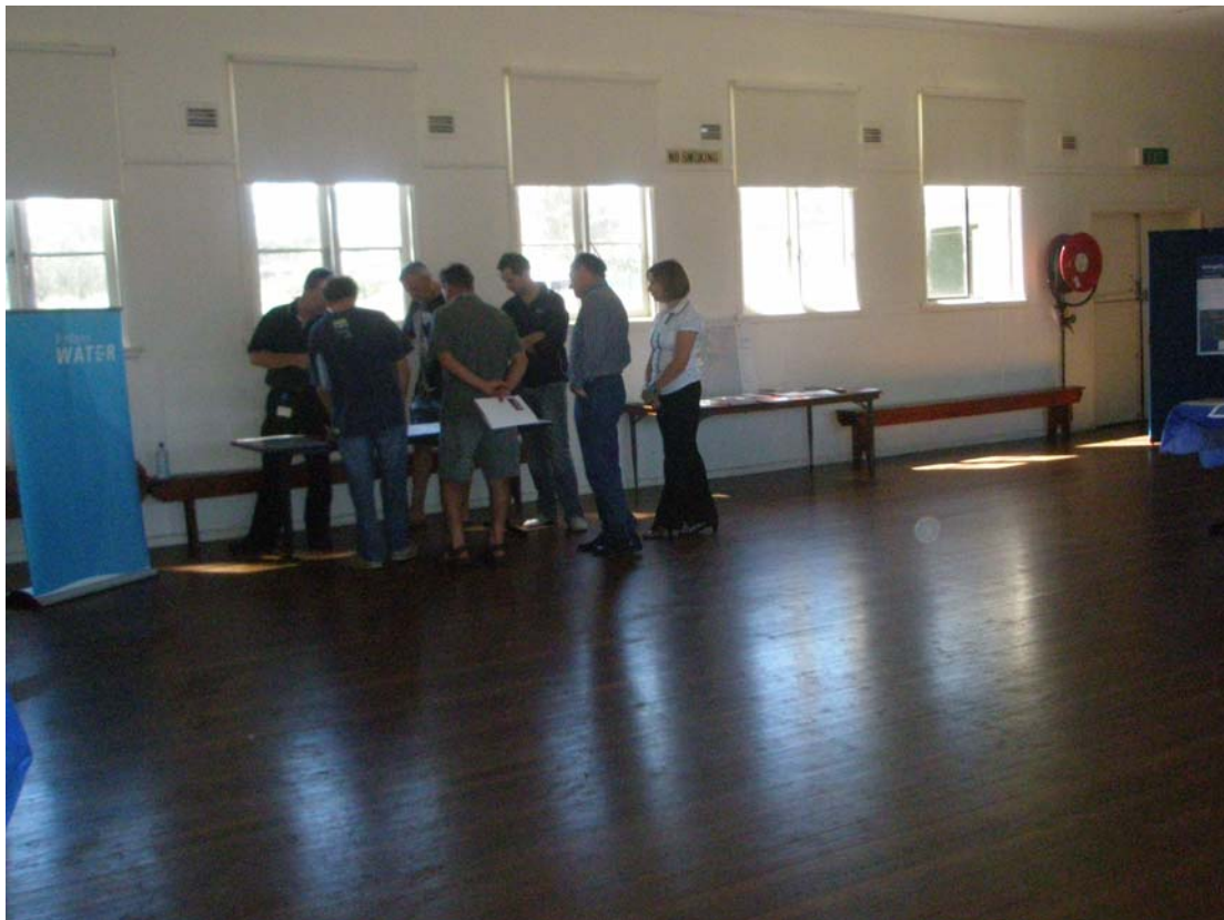
Community information session held on 19 December 2009 at Leppington Progress Hall