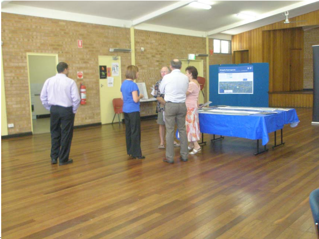
Community information session held on 12 December 2009 at Bringelly Community Centre