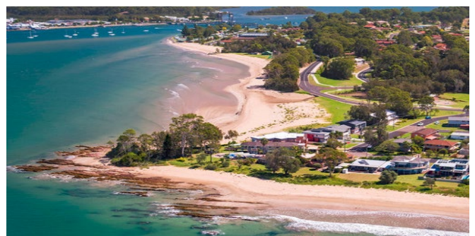
Surfside, looking west.