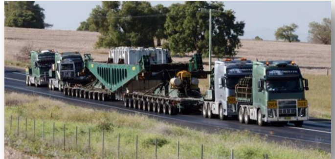
175 tonne transformer - they are moved state wide every couple of years.

For more information visit www.rms.nsw.gov.au or contact the office on the details below.