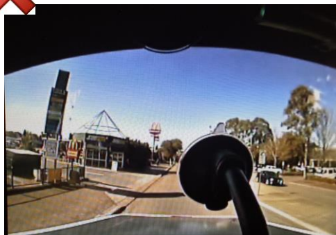
Incorrect position – suction holder obstructing the view; cabin interior taking up 25% of view and road not fully visible