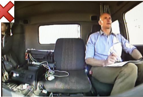
Incorrect position – applicant not in full view