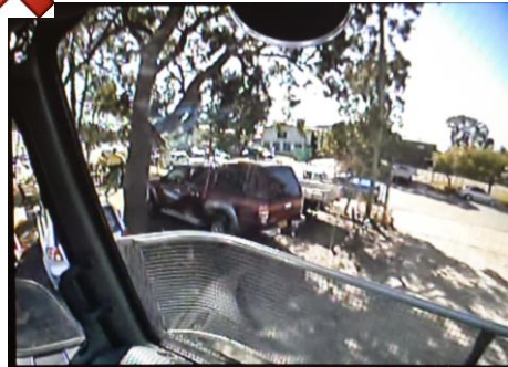
Incorrect position – camera positioned facing the left and road not fully visible