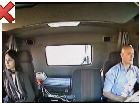
Incorrect position – camera tilted upward too much and hence roof taking up 25% of the view