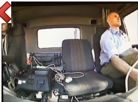
Incorrect position – camera tilted downward too much; applicant not in full view