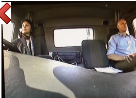
Incorrect position – dashboard obstructing almost 50% of the view