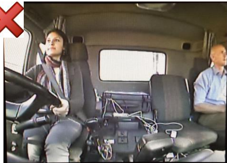
Incorrect position – assessor not in full view