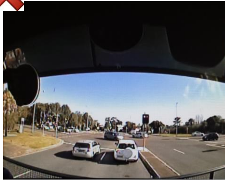
Incorrect position – cabin interior taking up 50% of view