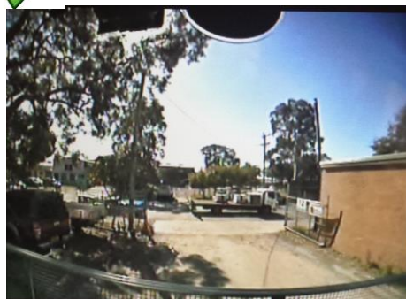
Correct position (View from a stationary truck within RTO premises) – camera not tilted with direct line of sight to road, as such the road is in full view with no obstructions