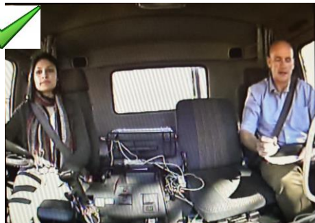
Correct position – applicant and assessor in full view; camera angle correct with no obstruction