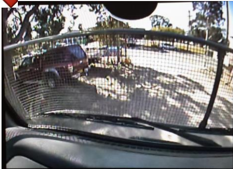
Incorrect position - camera tilted downward and dashboard taking up 20% of the view