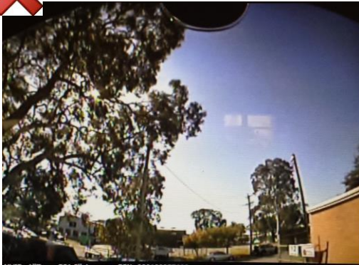
Incorrect position – camera tilted upward and road not visible