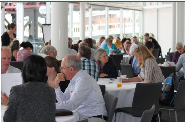
Participants discuss workshop scenarios at the forum

The NSW Roadside Environment Committee (REC) hosted the NSW Linear Reserve Environmental Management Forum in Sydney on Tuesday 30 October 2012 at the Australian National Maritime Museum, Darling Harbour, Sydney. The forum provided an opportunity for land managers and other interested people to learn and discuss operational and strategic issues facing linear reserves in NSW.